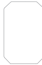
1 X CRYSTAL VESSEL